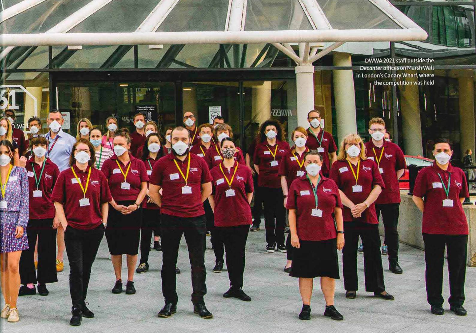
DWWA 2021 staff outside the Decanter offices on Marsh Wall in London's Canary Wharf, where the competition was held

£22.95 Annessa Imports, Continental Wine & Food