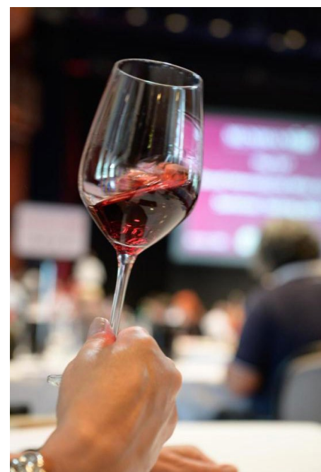
MUNDUS VINI Summer Tasting 2022

Among the other Best of Show wines, the list includes wines such as the POMMERY Cuvée Louise Champagne Brut Nature 2006 (France, Best of Show Champagne), the 2018 Salentein Gran VU Blend (Argentina, Best of Show Argentina) or the 2021 Iphöfer Julius-Echter-Berg Riesling Trockenbeerenauslese from VDP Weingut Wirsching in Franconia (Germany, Best Noble Sweet Riesling).