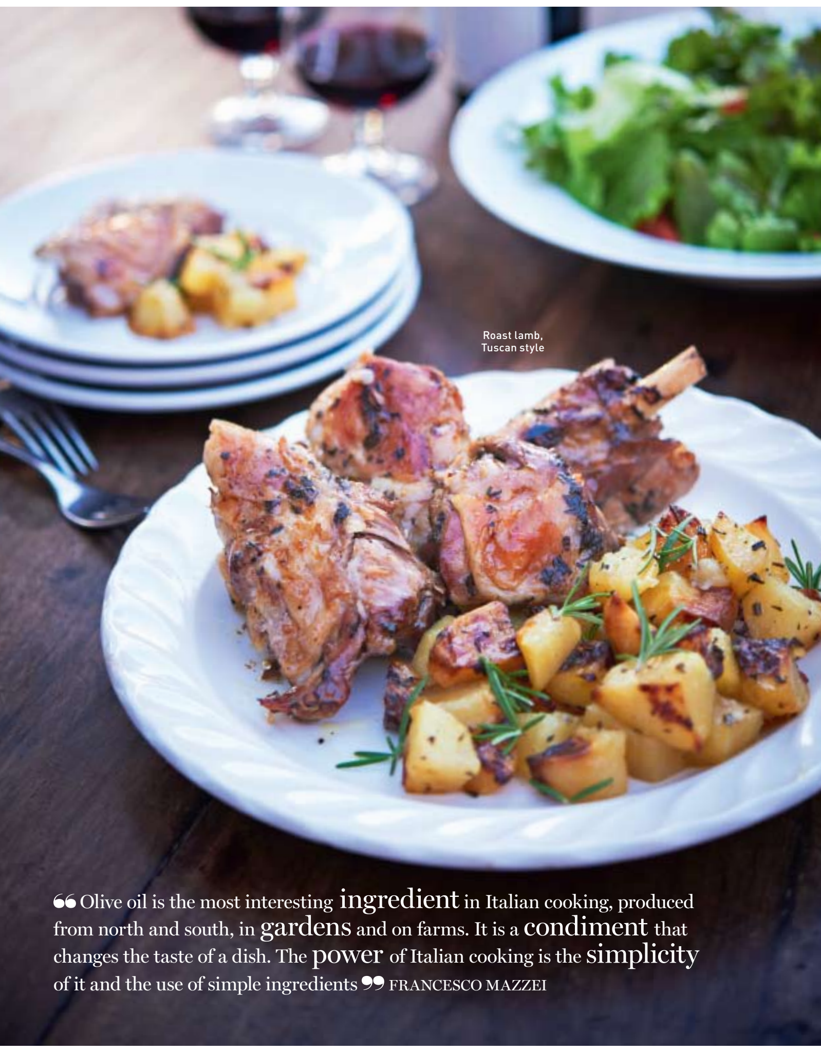
Roast lamb, Tuscan style

“Olive oil is the most interesting ingredient in Italian cooking, produced from north and south, in gardens and on farms. It is a condiment that changes the taste of a dish. The power of Italian cooking is the simplicity of it and the use of simple ingredients” FRANCESCO MAZZEI