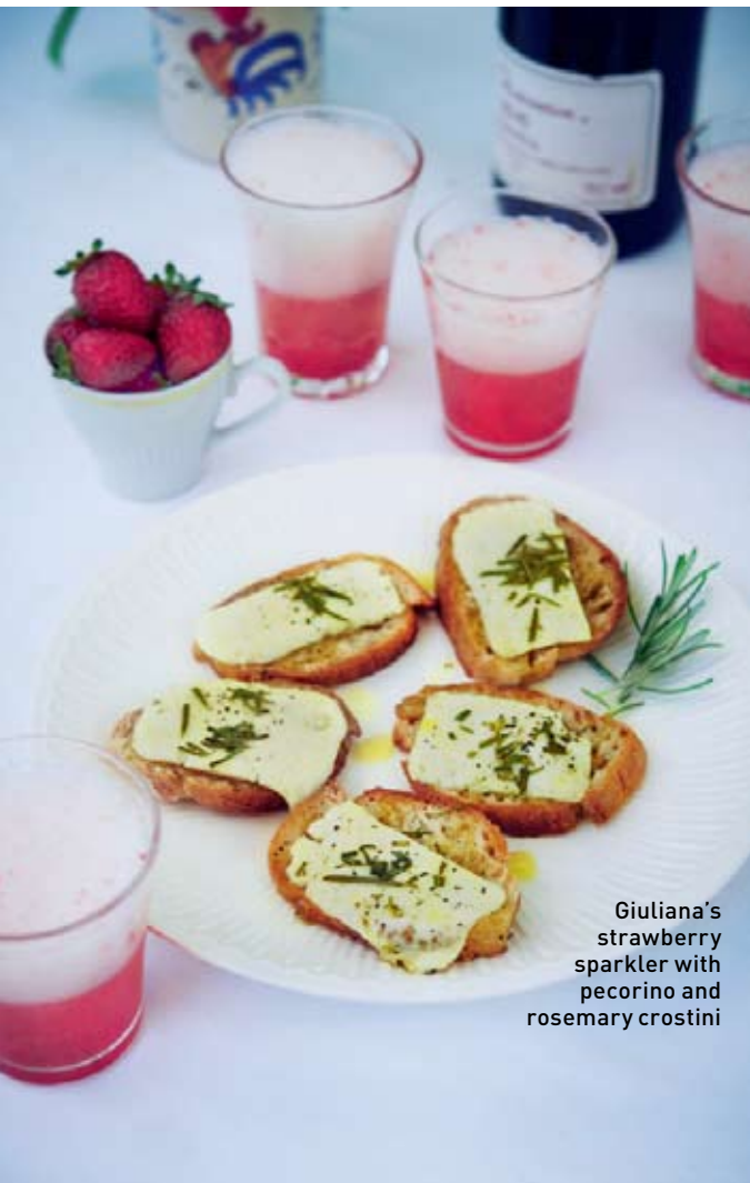
Giuliana's strawberry sparkler with pecorino and rosemary crostini

Olive pâté, p65, and peperotta (red pepper pesto)