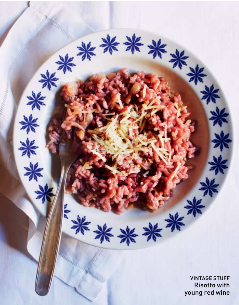
VINTAGE STUFF Risotto with young red wine

“Italian cooking at its best is home cooking of great simplicity, where the only important elements are good ingredients and love” ANNA DEL CONTE