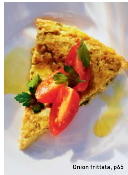
Onion frittata, p65