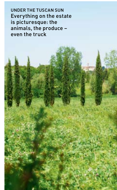
UNDER THE TUSCAN SUN Everything on the estate is picturesque: the animals, the produce – even the truck

For those visitors who book one of the pretty converted cottages dotted around the farm there are home-cooked meals to enjoy under the giant fig tree at the main farmhouse. The simplicity of Tuscan cooking, using only the best and freshest ingredients, shines through in these fabulous recipes from La Vialla's kitchens. There's a lot of olive oil, a lot of family heritage and a lot of sun-kissed passion in these dishes – and they taste good... »