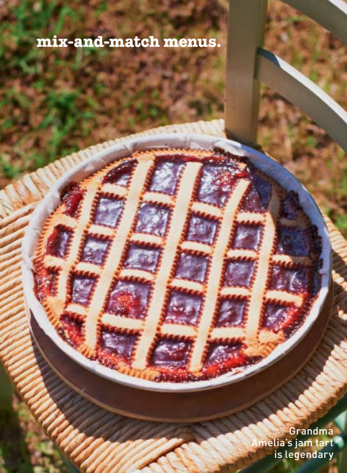
Grandma Amelia's jam tart is legendary