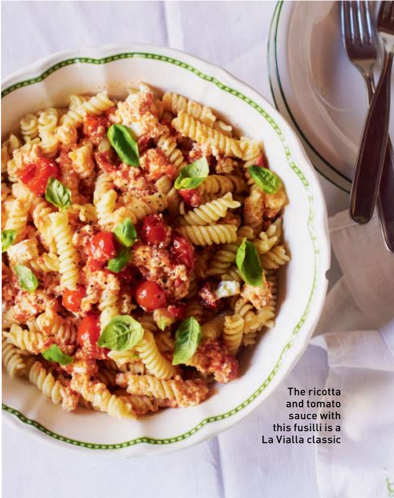
The ricotta and tomato sauce with this fusilli is a La Vialla classic

PER SERVING (BASED ON 6) 36kcal, 2.7g fat (0.7g saturated), 1.2g protein, 1.8g carbs (1.6g sugars), trace salt, 0.6g fibre