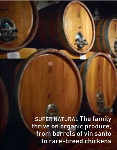
SUPER NATURAL The family thrive on organic produce, from barrels of vin santo to rare-breed chickens